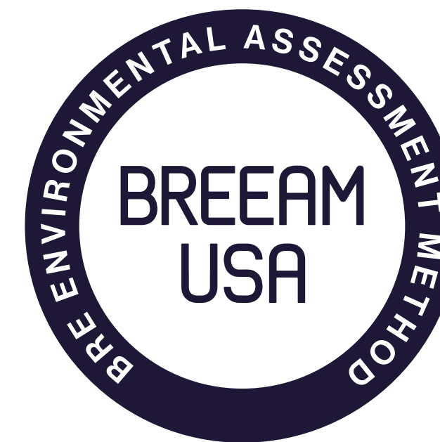
4. BREEAM USA certification mark