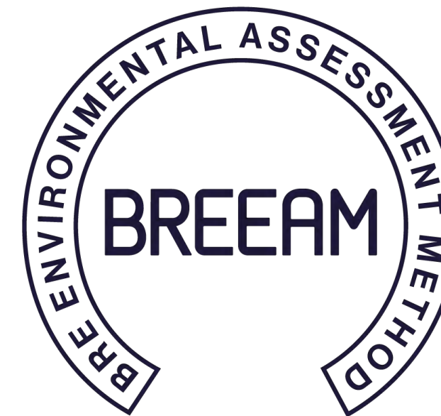
4. BREEAM certification mark